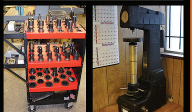
TOOLING AND INSPECTION EQUIPMENT