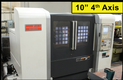
10" 4 th Axis

ONLINE AUCTION ENDS April 17 WEDNESDAY 2PM ET / 1 PM CT Starts: Apr. 8 th