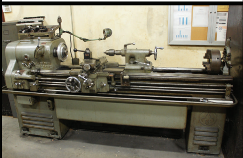
LEBLOND DUAL DRIVE LATHE