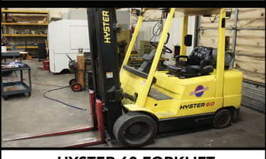
HYSTER 60 FORKLIFT