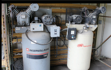
INGERSOLL RAND AIR COMPRESSORS