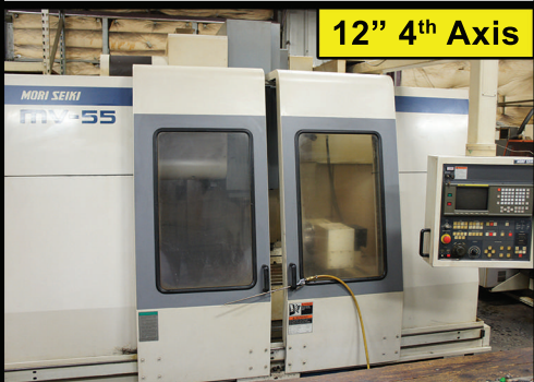
12" 4 th Axis